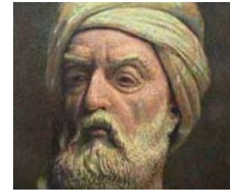
Hakim Abol-Ghasem Ferdowsi Toosi (940-1020) World famous Persian (Iranian) poet